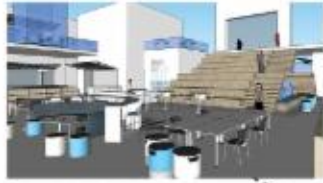
CHOICE FINANCIAL BUSINESS CENTER