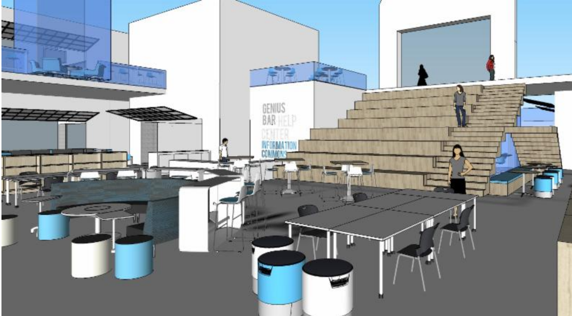
Student gathering space