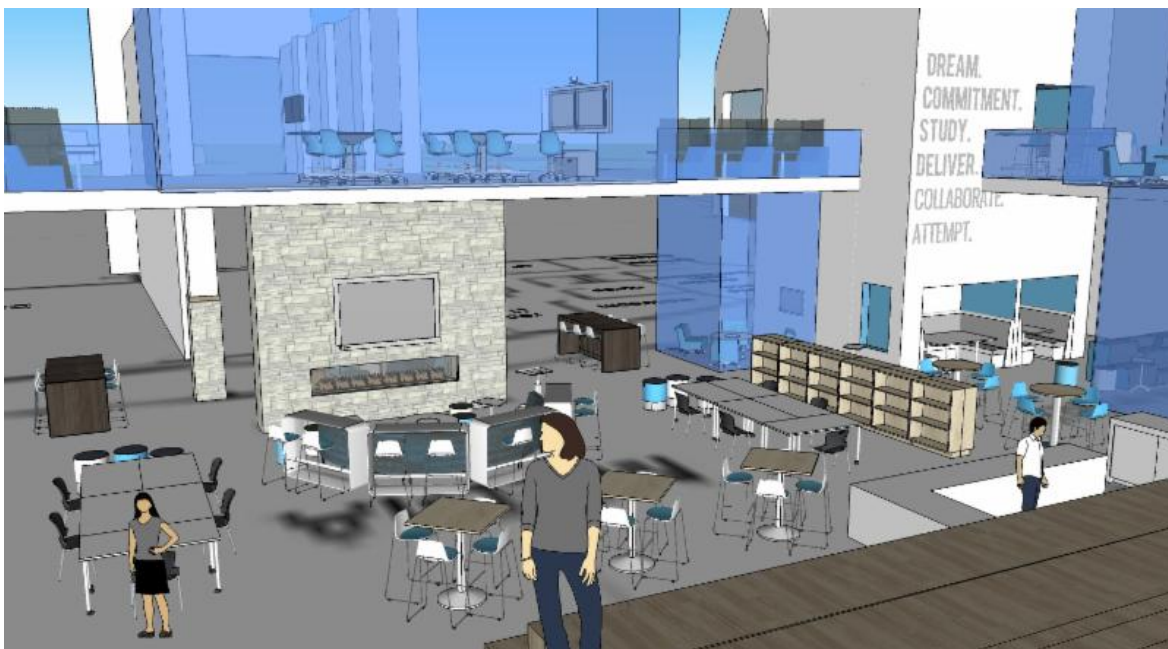
View of main student collaboration space

Take a look at some architectural renderings of the new SMCHS!